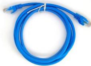
RJ45 Cat6+ cable 2M*1