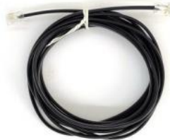
RJ14 6P 3M*1